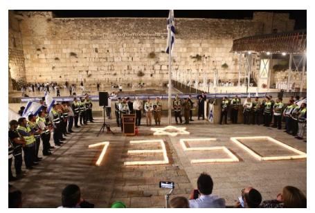
Israeli casualties of October 7th, 2023

Shaving Israel P. O. Box 6991 Chesterfield, MO 63006-6991